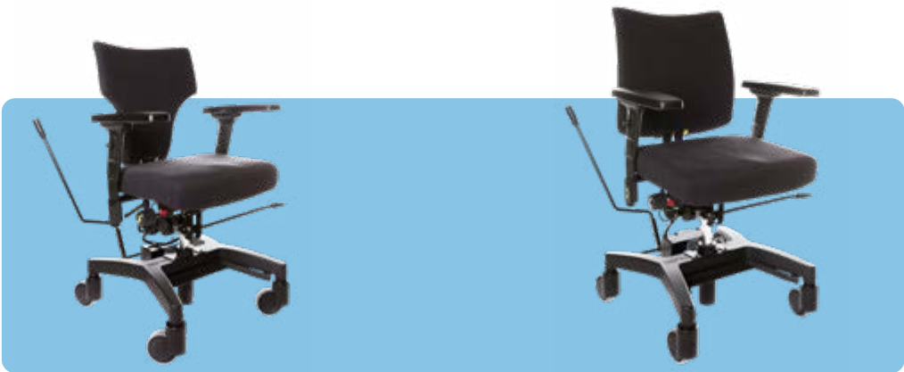
Hepro E2 Luna Tilt Small Small Article nr. 32518