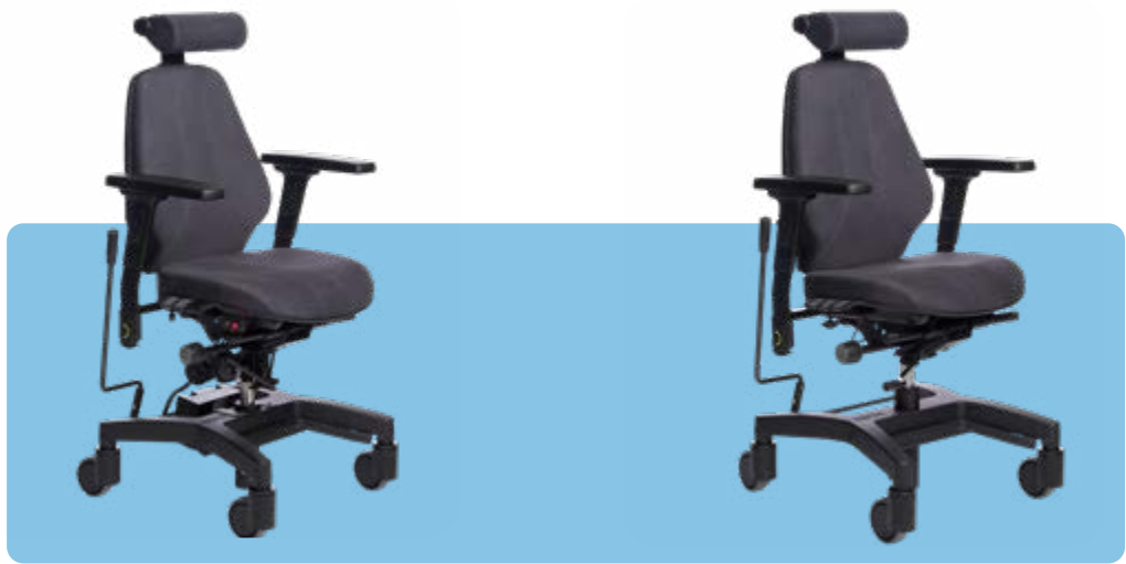
Hepro E2 Tilto 10/15 HR Article nr. 30072/30356