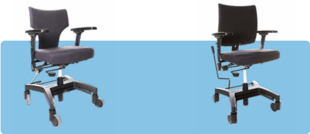
Hepro G2 Luna Tilt Small Small Article nr. 32516