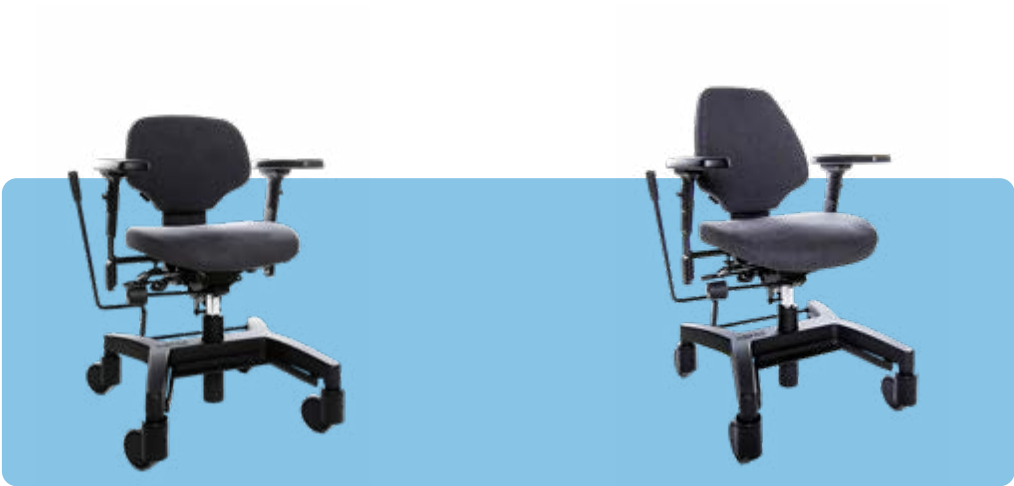
Hepro G2 Aktiv 15 M Medium Article nr. 30312