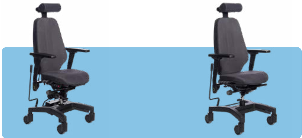
Hepro E2 Tilto 10/15 EHR Article nr. 30366/30358