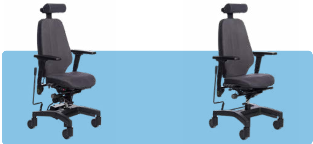
Hepro E2 Tilto 10/15 EHR 24-7 Article nr. 30362/30360